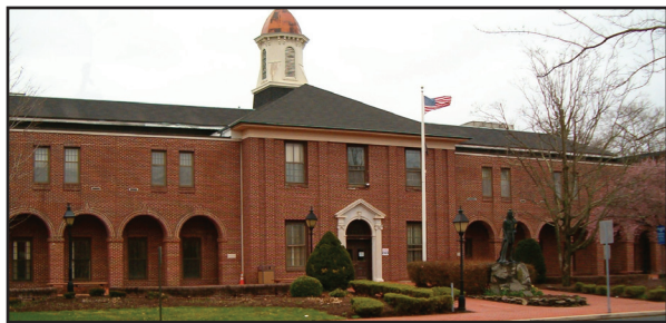
Atlantic County Surrogate Court/Mays Landing