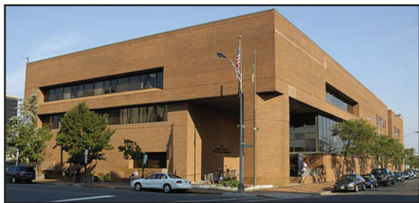
Atlantic County Surrogate Court/Atlantic City

The Office of Atlantic County Surrogate was first instituted when the County was formed in 1837. The then Governor of New Jersey appointed the first Atlantic County Surrogate. A few years later Surrogates were elected by the people for five year terms. The Surrogate's Court was formerly known as the Orphan's Court. The Surrogate is the only elected judge in each county.