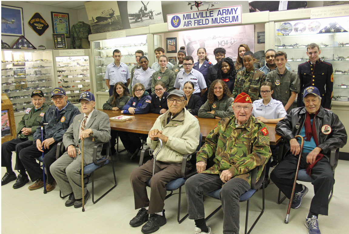
World War II veterans and Millville High School student re-enactors at Veterans Appreciation Day 2019