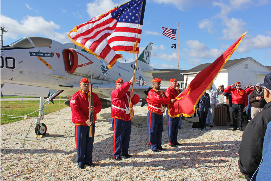
Semper Marine Detachment 205 of Vineland presented the colors for more than 250 visitors to Veterans Appreciation Day at Millville Executive Airport in 2019.