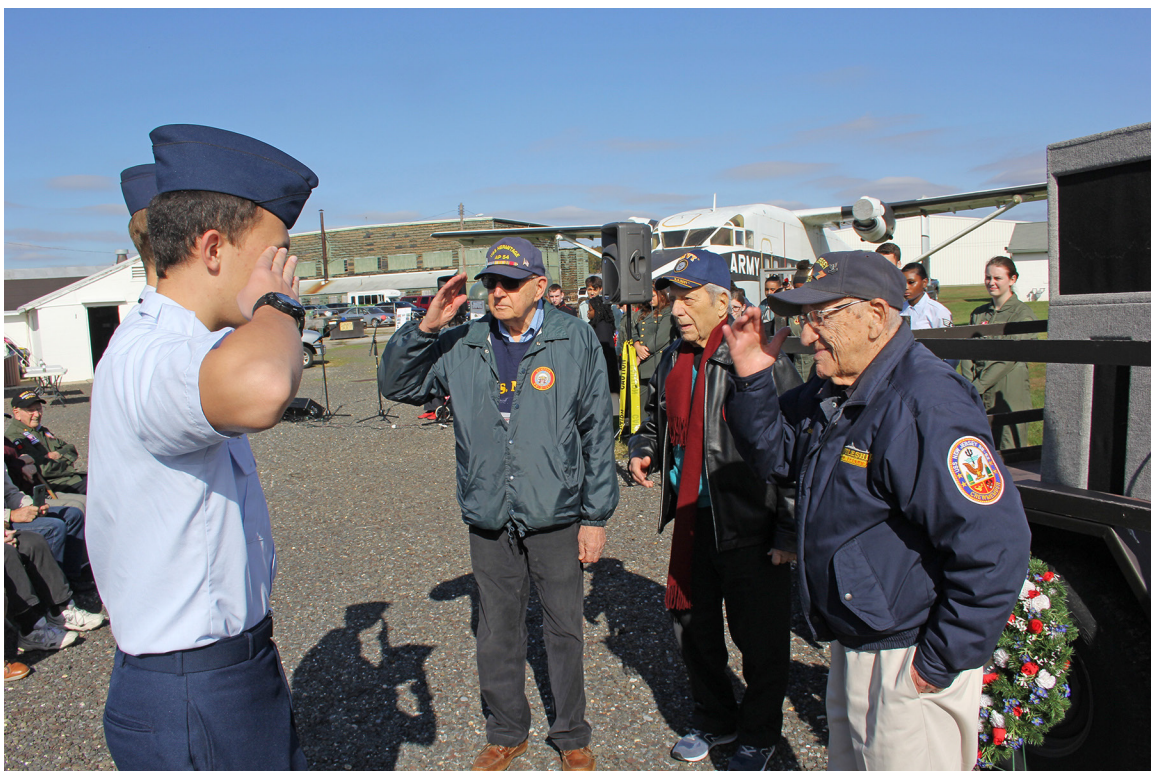
World War II veterans saluted by members of the Cumberland Civil Air Patrol at Veterans Appreciation Day 2019.